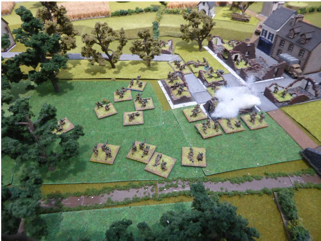
A sustained push by B-troop and X-troop threatens to overwhelm the battered defenders in Rots whilst the reserve Y-troop are ready to exploit the break-in