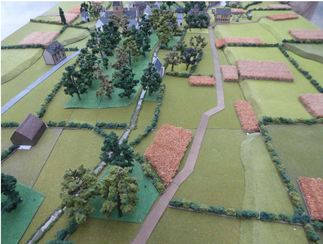
Seen from the north board edge, the wooded River Mue valley separates the two axes of attack with the main attack going down the line of the unpaved road leading to Le Hamel. Just above the centre of the photo is the watermill (not windmill RMD...) where, historically, the final 'O-group' by 46 RM Commando was held.