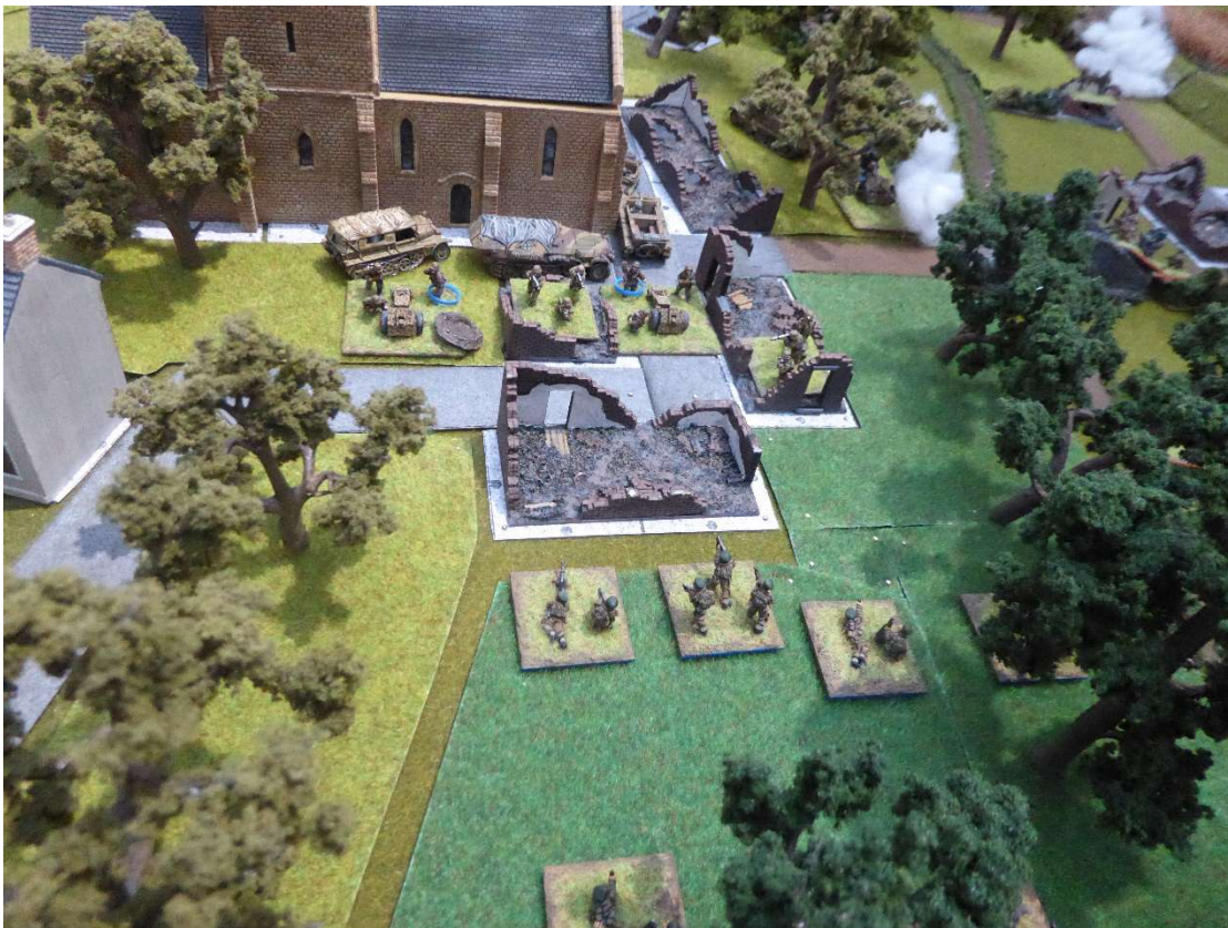
Whilst awaiting fresh reinforcements, Z-troop pull back out of Rots to escape punishing fire from the infantry guns. A stand-off, but two reinforcement troops of Commandos approach from Le Hamel