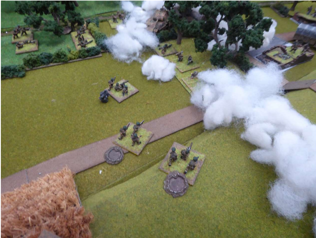
The assault on Le Hamel intensifies. B troop move forwards towards the Panther. Under cover of smoke, X-troop launch an attack on the PAK position in the orchards but get forced to ground by intense defensive fire