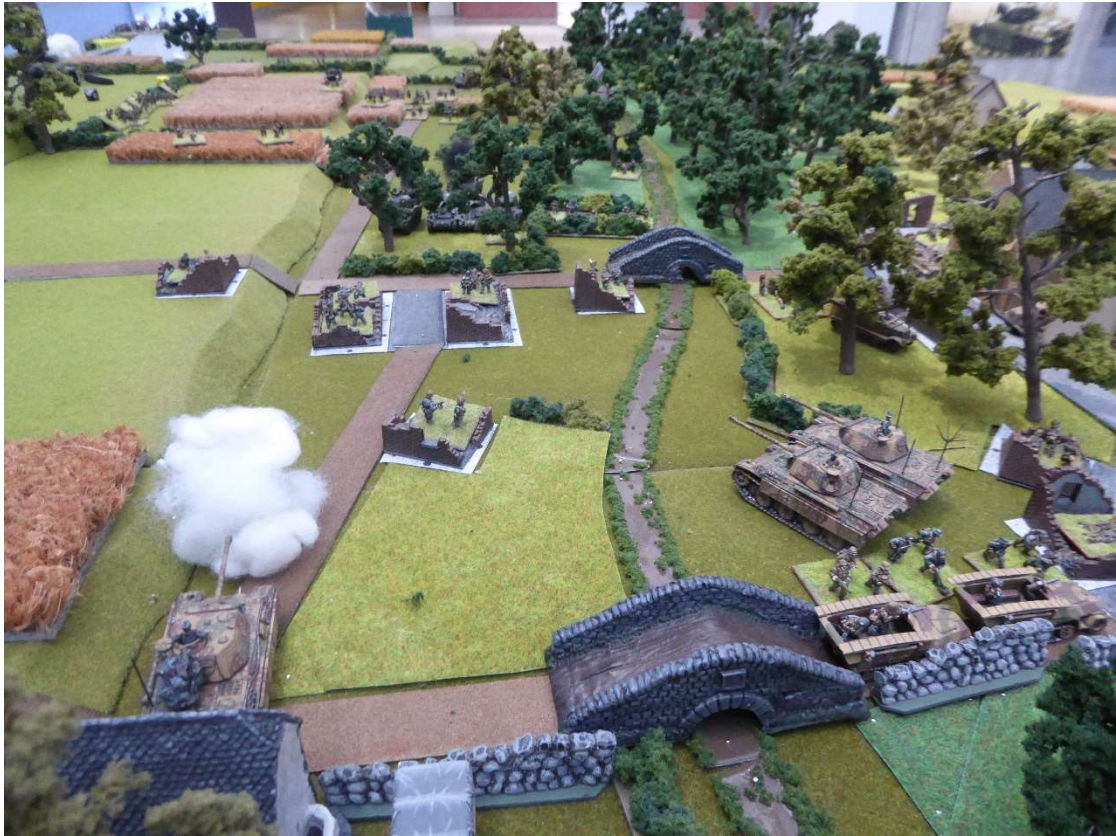
Seen from the south. Sensing that the defence of Le Hamel is coming to an end, Panzer-pioneers and Panthers start to form a strong fall-back position around the high walls of the Chateau's estate