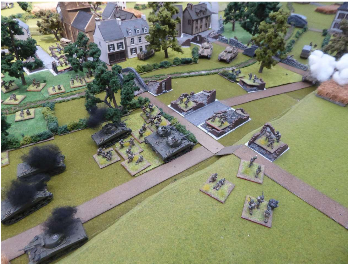
The pendulum swings back in favour of the Allies. The Chauds are firmly established in Le Hamel but reluctant to push south towards strong German positions at the Chateau.