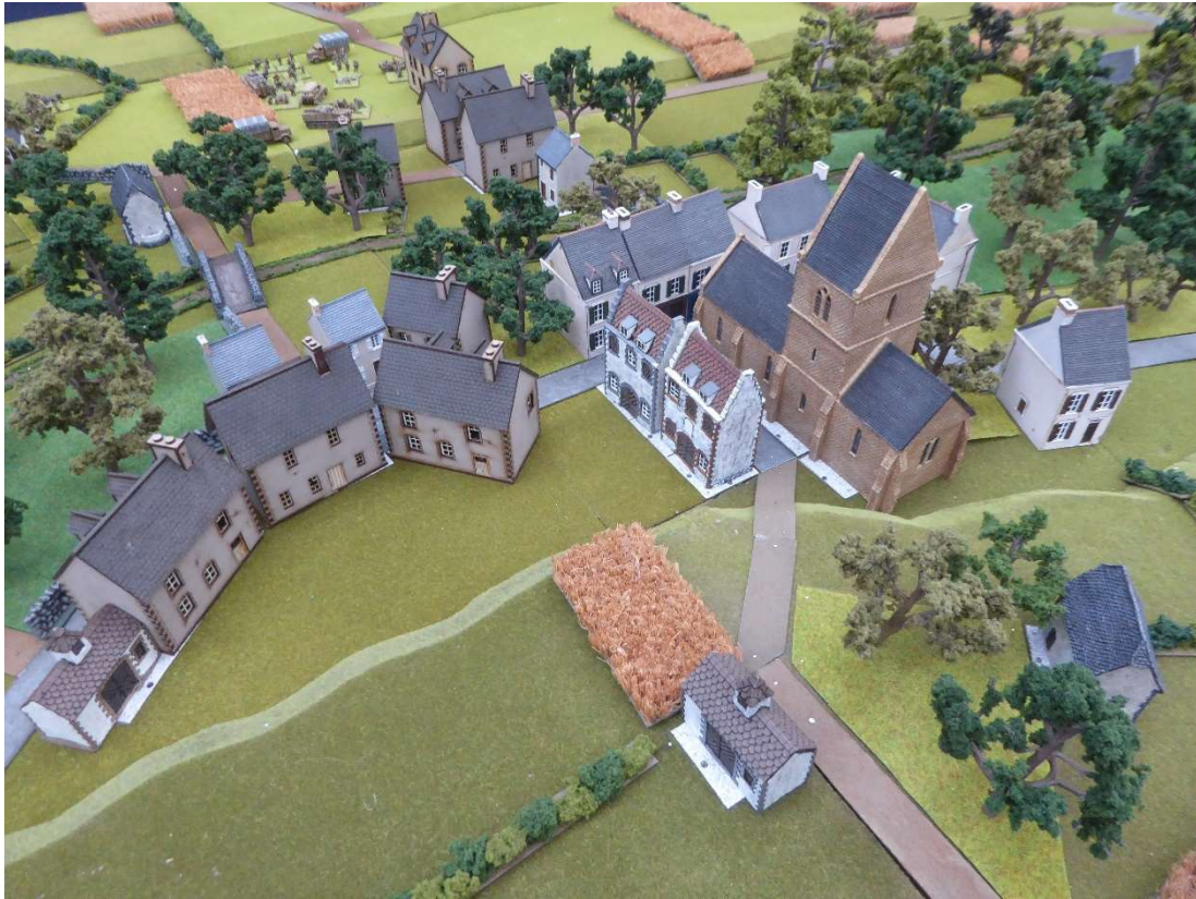
Seen from the east, all quiet in Rots... The Church (Tiger Terrain) dominates the north part of the village but woods and orchards do provide a covered approach. On the west side of the river, SS-Panzergranadiers gather outside Le Hamel to plan their deployment