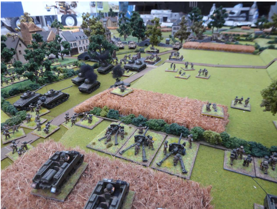
The Chauds anti-tank platoon gets into position and threatens the Panthers still lurking on the open flank behind Le Hamel