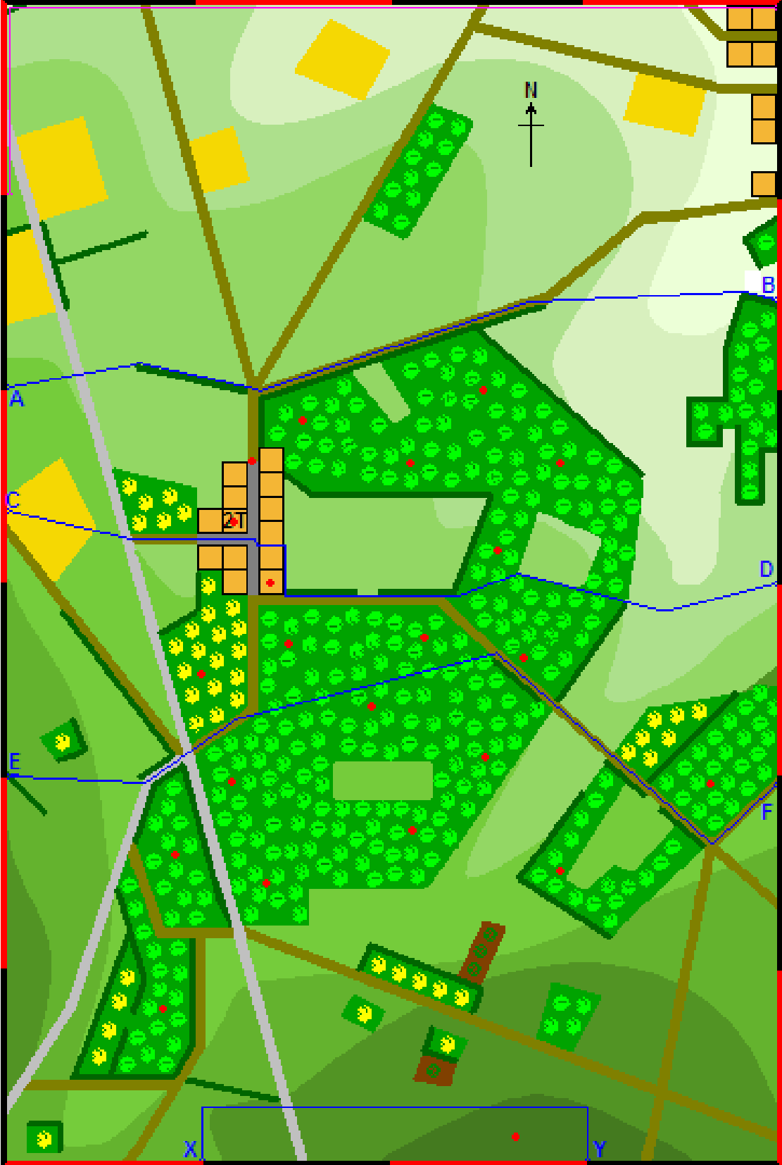
The battle area was mostly dense woodland with thick undergrowth.