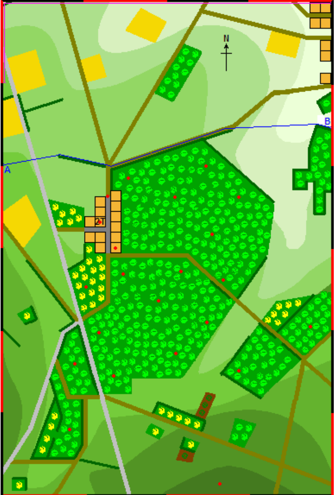
Map & Terrain

The battle area was mostly dense woodland with thick undergrowth.