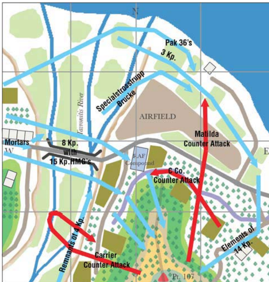
Scenario map showing replay of the battle for Maleme Airfield and Pt. 107.

This replay of the Maleme battle yields a slightly different result.