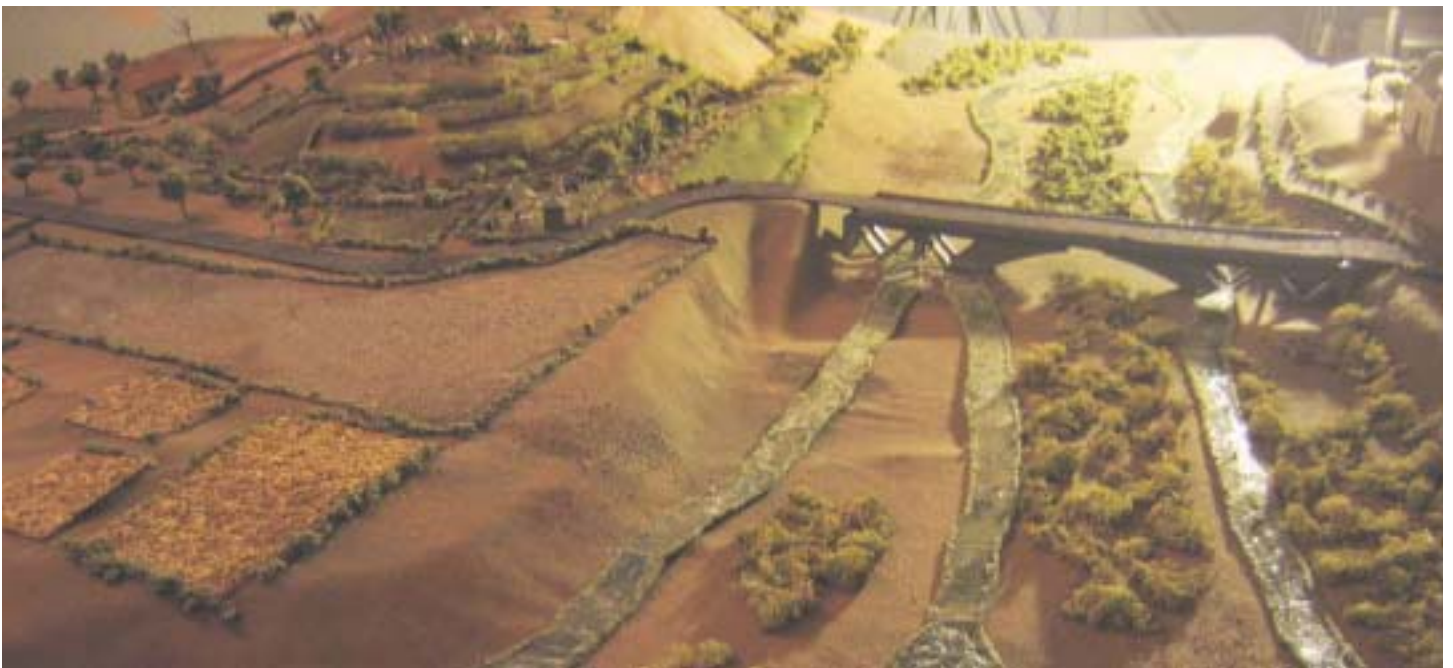
View looking south.

The New Zealand forces were dug in around the airfield and in depth up the slope of Pt. 107. Rows of barbed wire (still hidden) blocked off the far exit of the bridge, at the base of the hill, and other wire cordoned off access to Pt. 107 from the south.