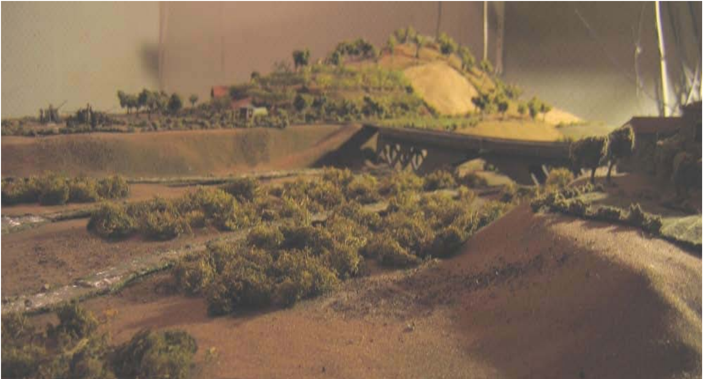
Point 107 and bridge, as seen from west side of valley, where the German attack originated. The airfield is the level ground to the left and beyond the valley.

The New Zealand forces were dug in around the airfield and in depth up the slope of Pt. 107. Rows of barbed wire (still hidden) blocked off the far exit of the bridge, at the base of the hill, and other wire cordoned off access to Pt. 107 from the south.