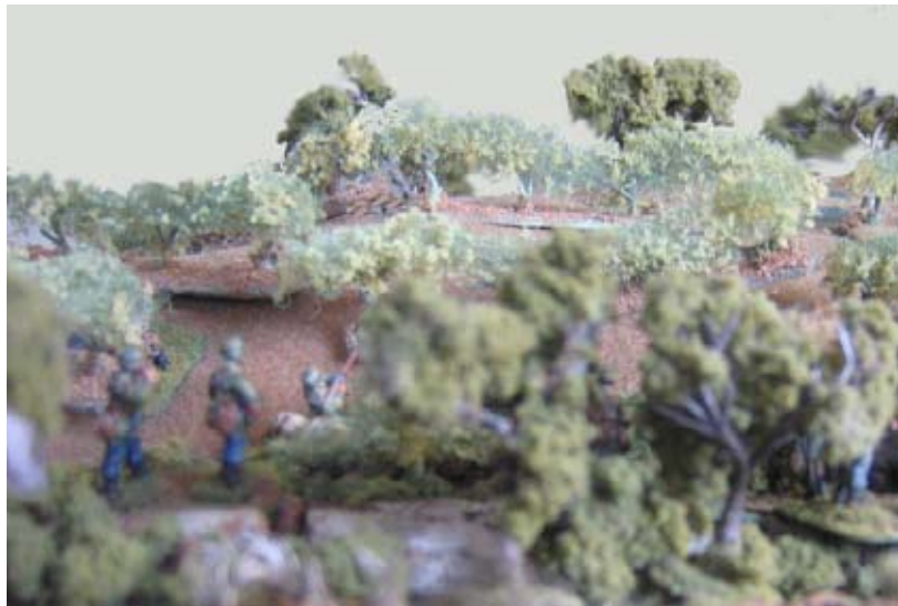
Battling into the olive groves.