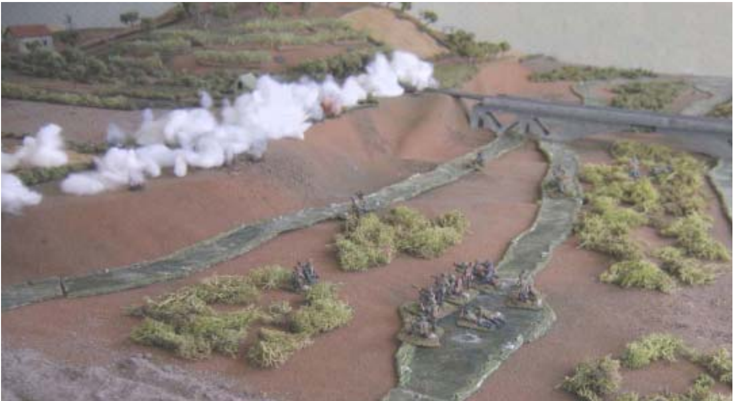
Above: Glider troops land in the Tavronitis valley. Below: Rapid advance towards airfield.