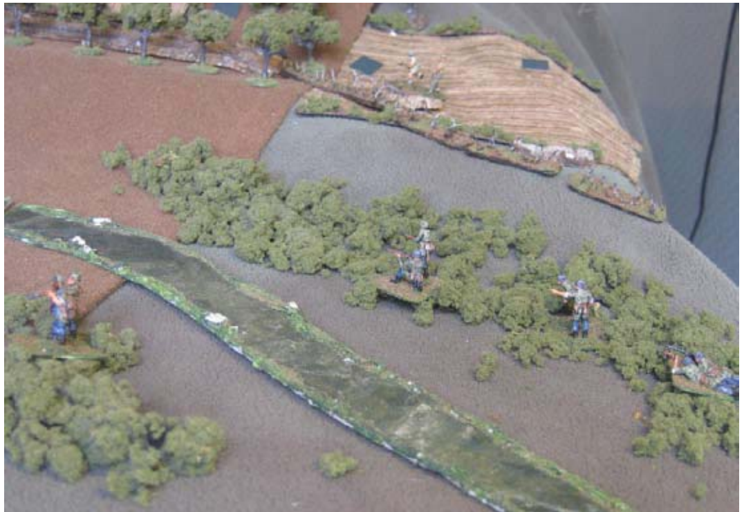
Remnants of 4 Kp. enter valley from south.

Remnants of 4 Kp., part of the initial wave of glider borne troops that had landed to a devastating reception on the south face of Pt. 107, filter in from the south end of the valley after their failed attempt to attack Point 107. A Vickers and N.Z. troops dug in behind barbed wire along the embankment open fire. 4 Kp. returns fire, knocking out the Vickers, before moving in under cover of the embankment to work their way up in support of the developing attack on the bridge and Pt. 107.