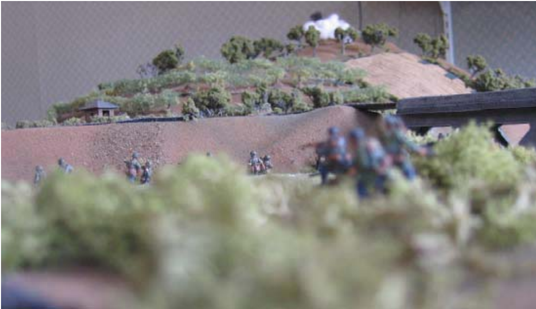
Smoke is laid by the German mortars on Pt. 107 in an attempt to obscure 88 Kp. as it moves across the valley.

Remnants of 4 Kp., part of the initial wave of glider borne troops that had landed to a devastating reception on the south face of Pt. 107, filter in from the south end of the valley after their failed attempt to attack Point 107. A Vickers and N.Z. troops dug in behind barbed wire along the embankment open fire. 4 Kp. returns fire, knocking out the Vickers, before moving in under cover of the embankment to work their way up in support of the developing attack on the bridge and Pt. 107.