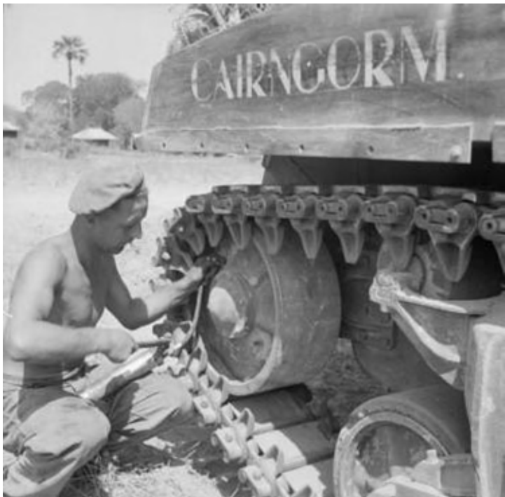
Right: A close-up of 'Cairngorm'.

Note the '51' serial on a two-tone Arm-of-Service sign, painted on the tank-phone box at the rear-right corner of the hull. The squadron tac-sign is also clearly visible on the turret side, showing the darker red ring inside the white outer ring. There does not appear to be a troop number, but if painted in red paint there might not be enough contrast for it to show up against the Jungle Green.