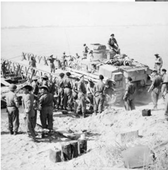
Left: A Lee of 3rd Carabiniers crossing the Irrawaddy in 1945.

The AoS '4' serial can just be made out on the rear-right of the hull.