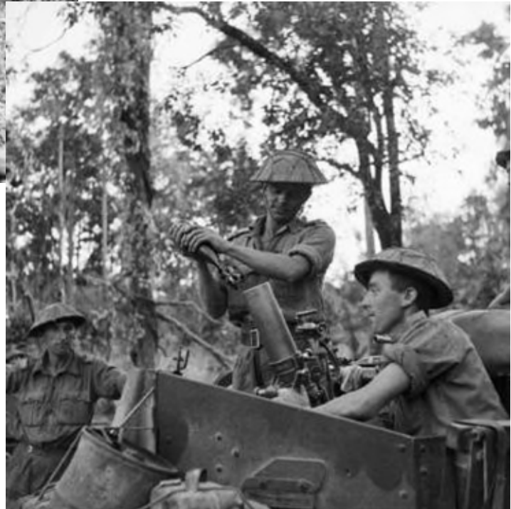
Right: Members of an unidentified unit of 2nd Division fire a 3-inch mortar from a Universal Carrier in 1945.

Note that the only marking visible here is a number '20' in front of the driver. The meaning of this marking is unknown.