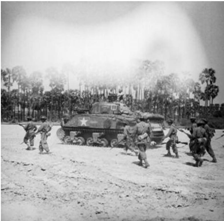
Left: A Sherman of 'B' Squadron, 5th (Probyn's) Horse supporting Indian infantry near Meiktila in 1945.

Note the number painted within the squadron tac-sign, indicating the 3rd Troop of 'B' Squadron (which would probably be the regiment's No. 7 or No.8 Troop). The commander (a Sikh – indicated by the turban and beard) is wearing a much paler uniform than the infantry, which suggests that he is wearing Khaki Drill, while the infantry are wearing Jungle Green uniforms.