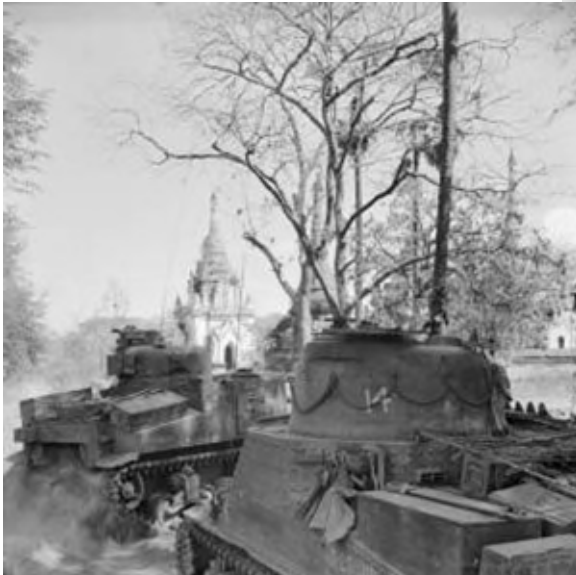
Left: Lees of 254th Indian Tank Brigade at Mandalay in 1945.

Note the number '14' painted on the turret rear. This could be a troop number or an individual tank number. There does not appear to be a squadron tac-sign, but this may be due a lack of colour contrast to make it stand out on the black & white photo.