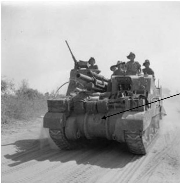
A Priest of 18th Field Regiment photographed in 1945.

The squadron tac-sign contained a number indicating the seniority of the Troop within the squadron (normally starting with the SHQ as '1').