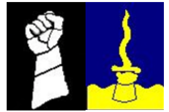
19th Lancers 1945 marking