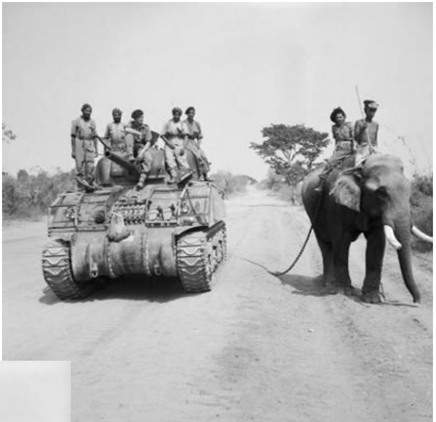
Left: A Sherman named 'BIDAR' belonging to the RHQ of the 9th (Royal Deccan) Horse, near Meiktila in 1945.

Note the two-tone Arm-of-Service sign, which is just visible behind some stowage, having been painted centrally on the upper edge of the transmission housing. The framework welded to the front to the tank was a common feature on Commonwealth tanks in Burma, being a mounting for barbed wire – the intention being to make it more difficult for Japanese infantry to climb on board.