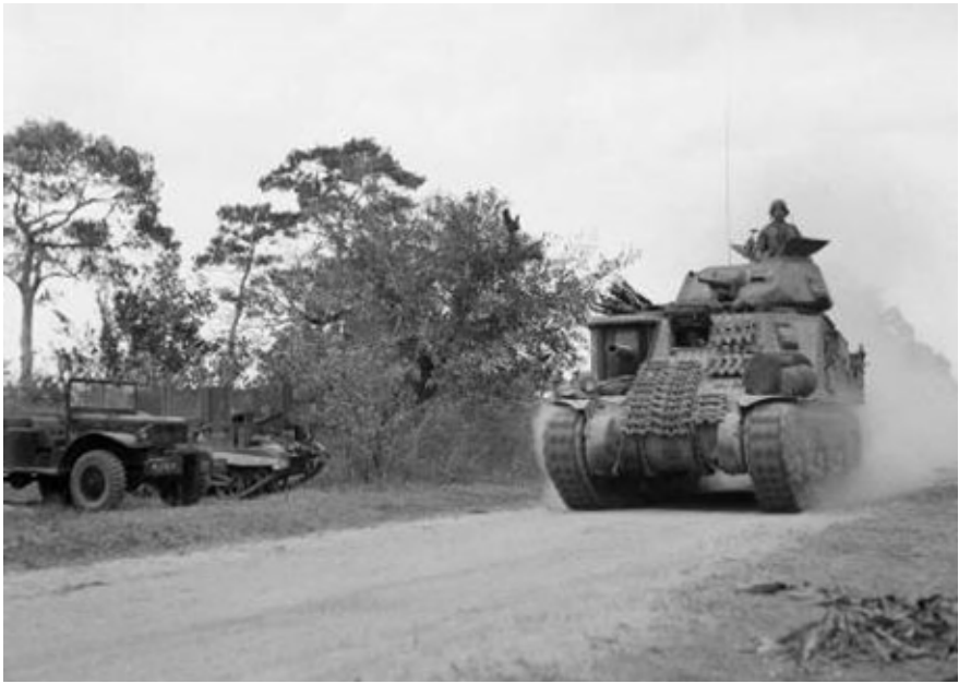
Left: A Grant Mk I of 'A' Sqn, 146th RAC on Ramree island in 1945.

Grant Mk Is, with the larger, British-designed turret, were very rare in Burma and served mainly with 149th RAC in 254th Tank Brigade. However, ten Grants served with 'A' Sqn, 146th RAC in 50th Tank Brigade (alongside two Lees). Note also the Universal Carrier with extended, deep-wading sides for amphibious landing.