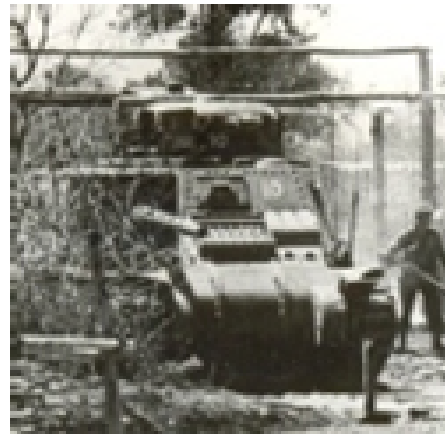
Above: A Lee of 254th Indian Tank Brigade at Imphal in 1944