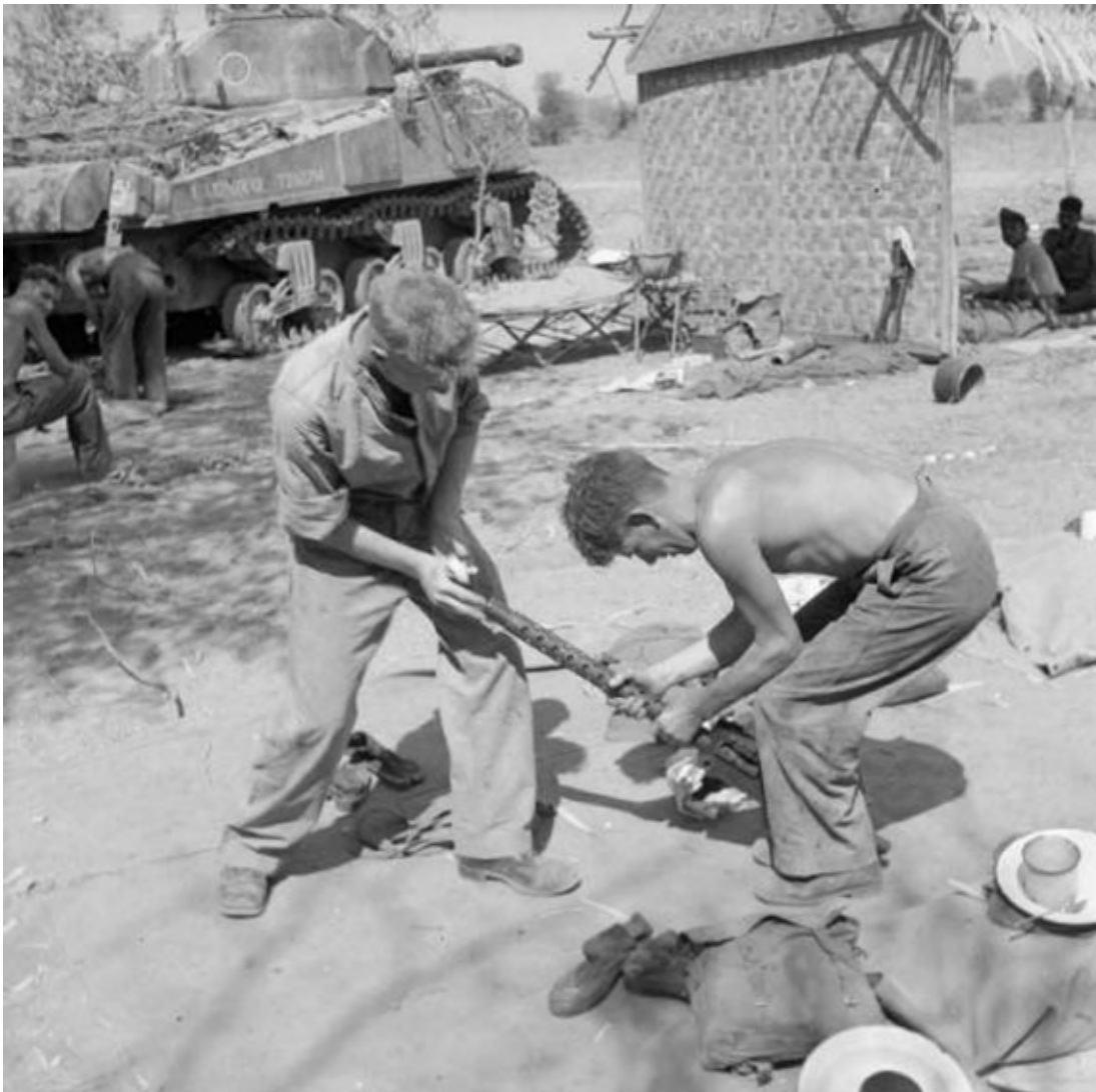
Above: The crew of a Sherman named 'CAIRNGORM', of 'C' Squadron, 116th RAC, carry out maintenance near Meiktila in 1945.

Note the '51' serial on a two-tone Arm-of-Service sign, painted on the tank-phone box at the rear-right corner of the hull. The squadron tac-sign is also clearly visible on the turret side, showing the darker red ring inside the white outer ring. There does not appear to be a troop number, but if painted in red paint there might not be enough contrast for it to show up against the Jungle Green.