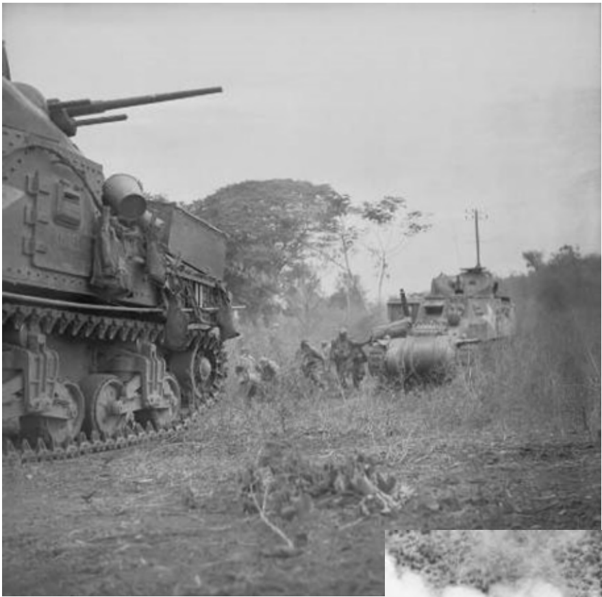
Left: Lees of 'A Squadron, 3rd Carabiniers, support Indian infantry during the advance to Rangoon In 1945.

Note the very large stars painted on the hull-sides. Although not very obvious, the name 'ANGEL' is painted on the side-door of the nearest tank. 3rd Carabiniers are known to have used names that started with the squadron letter. 'ANGEL', 'AUK' and 'AINTREE' are recorded for 'A' Squadron.