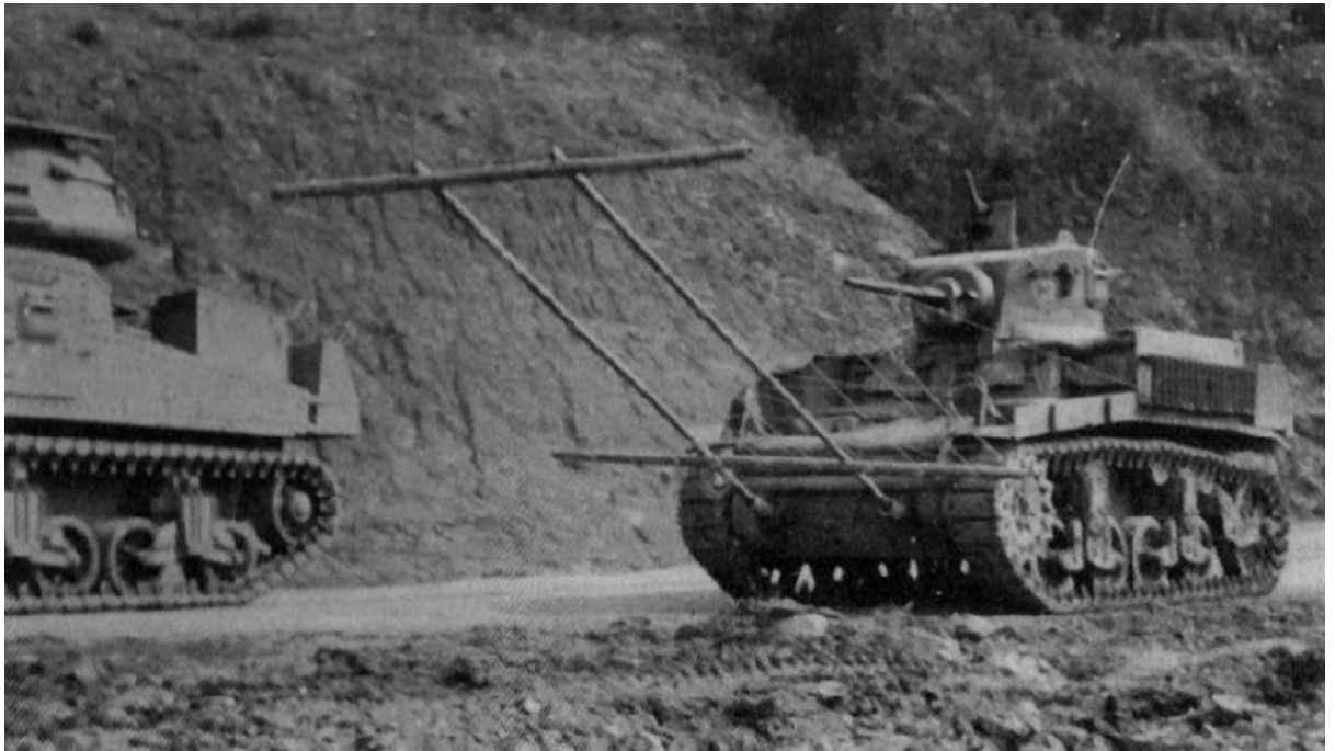
Above: On the left of this photo, taken at Kohima, is a Grant Mk I (note the turret shape) of 149th RAC. This regiment's RHQ, 'A' Sqn and 'B' Sqn were equipped with Grant, while 'C' Sqn was in the Arakan, equipped with Sherman Mk V. The Stuart is an attached 'minesweeper' tank belonging to 45th Cavalry (see XXXIII Corps below).

This strangely-named tank (a reference to the 'Bonnie Prince' Charles Stuart) had originally been landed with the British 7th Hussars (7th Armoured Brigade) at Rangoon in 1942 and had fought with that regiment during the long retreat to the Chindwin River. It then became the only tank of that brigade to be successfully withdrawn across the Chindwin. Later passed to the Indian 7th Cavalry, it had its turret removed and became the Commanding Officer's mount. In 1945 it came full circle and re-crossed the Chindwin, becoming the only Allied AFV to return to Burma after the retreat of 1942. Note the elaborate anti-grenade mesh fitted over the turret opening.