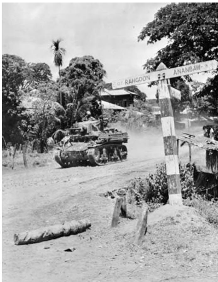
Right: A Stuart of the 45th Cavalry.

The minesweeper frame was built from bamboo and supported a net of explosive cordtex, which would then be laid across a minefield and then detonated. Examination shows that there is a number '3' painted (apparently in white) on the turret, surrounded by a 'C' Squadron circle, which is in a darker colour. The number 3 might mean 3rd Troop of 'C' Squadron (which would equate to the regiment's No.11 Troop) or 3rd tank of 'C' Squadron. The darker colour is wrong for a corps recce regiment (which would be white), so it seems likely that they used the green signs of a fourth armoured regiment in an armoured brigade.