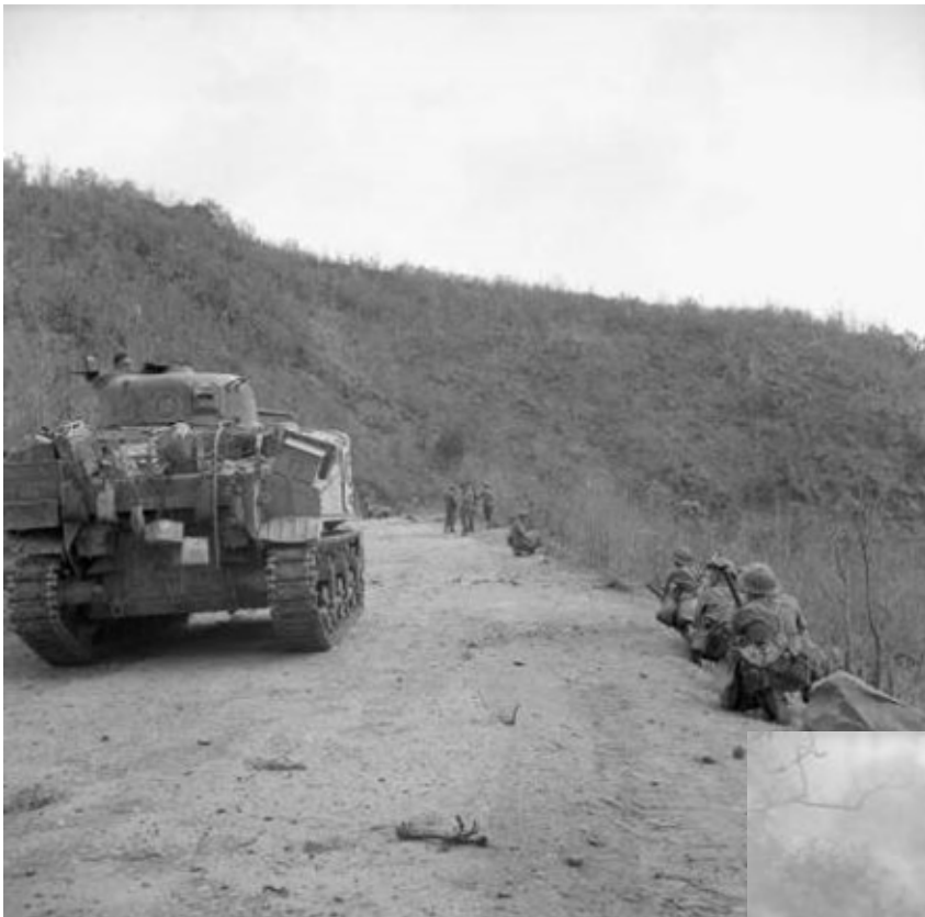
Left: A Lee of 'C' Squadron, 3rd Carabiniers, near Mount Popa in 1945.

Note the squadron tac-sign painted on the turret, with the troop number ('12' – No.12 Troop) painted within, in white.