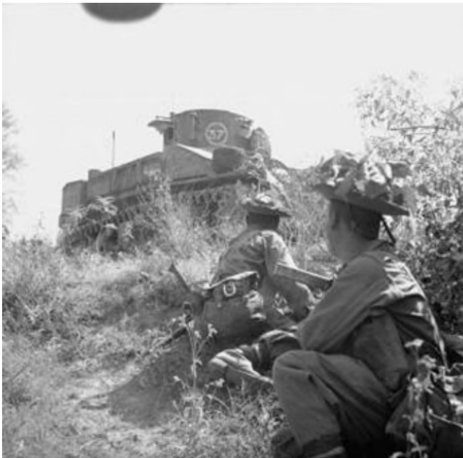
Left: A Stuart III of 'C' Squadron, 7th Light Cavalry, supports the 6th Gurkhas in the Irrawaddy Bridgehead, February 1945.

As in the earlier photograph of a 7th Cavalry Stuart, this tank has an individual tank number ('37') painted within the squadron sign instead of the troop number normally painted on Lees.