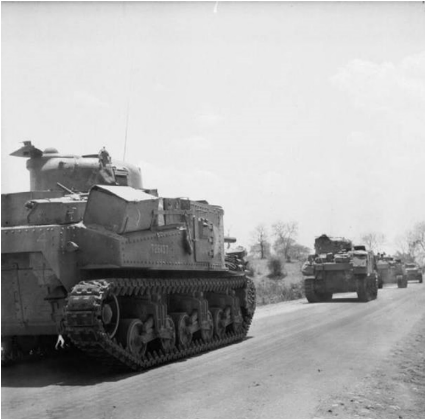
Above: Lee tanks of 3rd Carabiniers somewhere near Mandalay in 1945.

Note the '4' Arm-of-Service serial on the rear-right corner of the nearest tank's hull and the very large star painted (badly) on the side of the 75mm gun sponson. This photo clearly shows how muted markings became with a good coating of Burmese dust and grime.