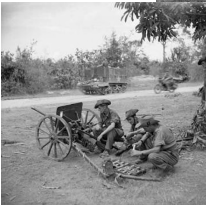
Left: Men of 2nd Division examine a captured Japanese gun in January 1945. In the background are two Universal Carriers fitted with deep-wading screens.