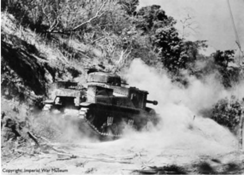
Left: A Lee of 50th Indian Tank Brigade in the Arakan.