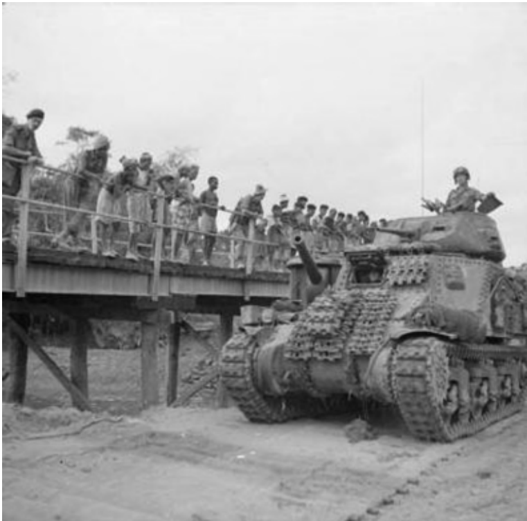
Right: A Grant Mk I of 'A' Sqn, 146th RAC, photographed on Ramree Island in 1945..

Grant Mk Is, with the larger, British-designed turret, were very rare in Burma and served mainly with 149th RAC in 254th Tank Brigade. However, ten Grants served with 'A' Sqn, 146th RAC in 50th Tank Brigade (alongside two Lees). Note also the Universal Carrier with extended, deep-wading sides for amphibious landing.