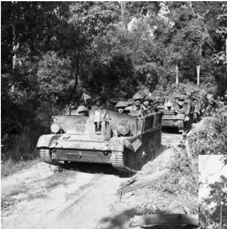
Left: Carriers of 2nd Recce Regiment patrol between Kalewa and Shwebo in 1945.

Note that the only marking visible here is a number '20' in front of the driver. The meaning of this marking is unknown.