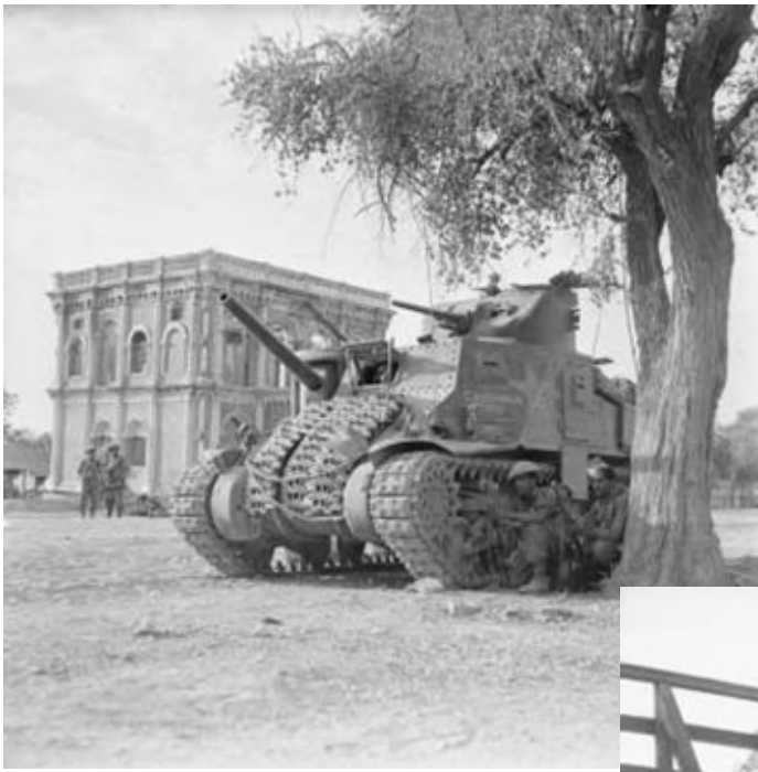
Left: A Lee named 'CALEDONIAN' of 'C' Squadron, 150th RAC in Mandalay, 1945.

Other tanks in the squadron are recorded as having the names 'CENTURION', CAVALIER' & 'CANNON'.