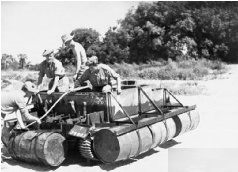
Left: Men of the 1st Queen's Own Cameron Highlanders (5th Brigade, 2nd Division) remove an improvised and ingenious flotation device from their Universal Carrier after crossing the Mu River during the advance to Mandalay in 1945.

Note the crossed keys formation sign of 2nd Division.