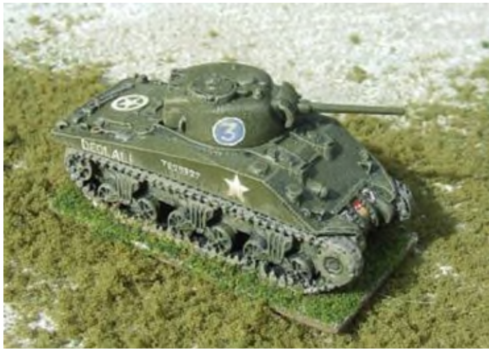
Sherman V tanks of the 9th (Royal Deccan) Horse at Meiktila, 1945