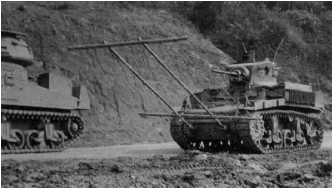
Above: As discussed earlier, the tank on the right is a 'minesweeper' Stuart belonging to the 45th Cavalry at Kohima in 1944.

The minesweeper frame was built from bamboo and supported a net of explosive cordtex, which would then be laid across a minefield and then detonated. Examination shows that there is a number '3' painted (apparently in white) on the turret, surrounded by a 'C' Squadron circle, which is in a darker colour. The number 3 might mean 3rd Troop of 'C' Squadron (which would equate to the regiment's No.11 Troop) or 3rd tank of 'C' Squadron. The darker colour is wrong for a corps recce regiment (which would be white), so it seems likely that they used the green signs of a fourth armoured regiment in an armoured brigade.