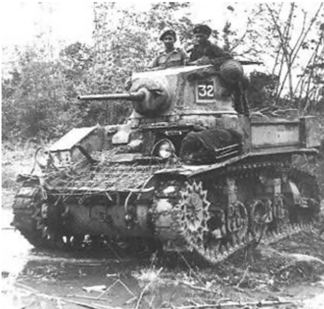
Above: A Stuart III of 'B' Squadron, 7th Light Cavalry, taken at Imphal in March 1944

Note the dark (black?) centre to the squadron tac-sign and the contrasting (white?) number within the tac-sign. There is another photo of a tank with '31' and a 'C' Sqn tank with '37'. This clearly is not a troop number, so it is probably an individual tank number. RHQ probably had numbers 1-4 and assuming 15 tanks per sqn, 'A' Sqn had 5-19, 'B' Sqn 20-34 & 'C' Sqn 35-49.