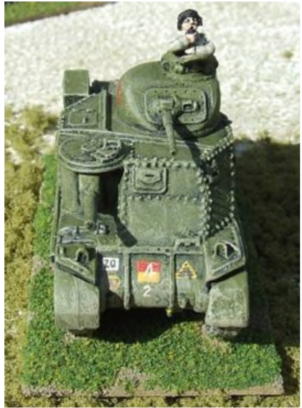
Lee tanks of 'C' Squadron, 3rd Carabiniers, Imphal, 1944 15mm 'Flames of War' models by Battlefront Miniatures, painted by the author