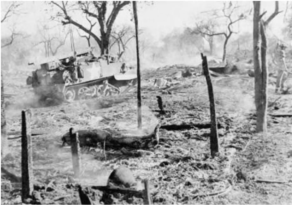
Left: A Royal Artillery OP Carrier photographed in 1945. Exact unit unknown.

Note the very large star painted on the side.