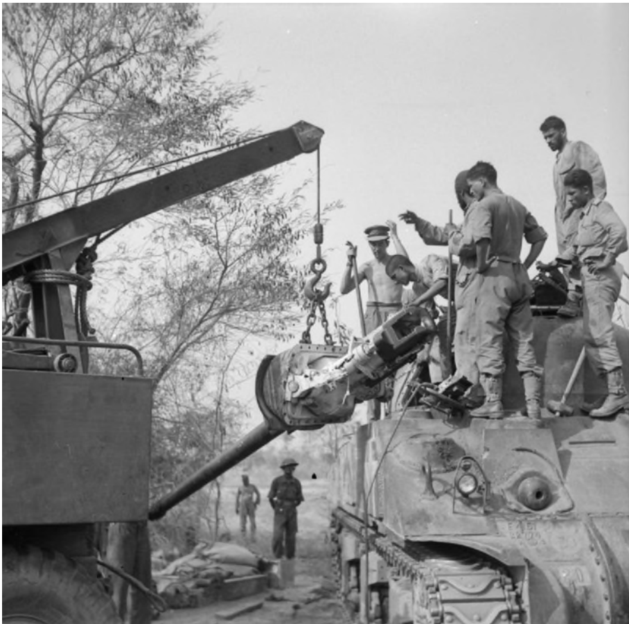
Left: A Sherman of 255th Tank Brigade undergoes maintenance in 1945.

Note again the mysterious '20' marking. Just visible above it is the weight classification disc – a black '30' on yellow.