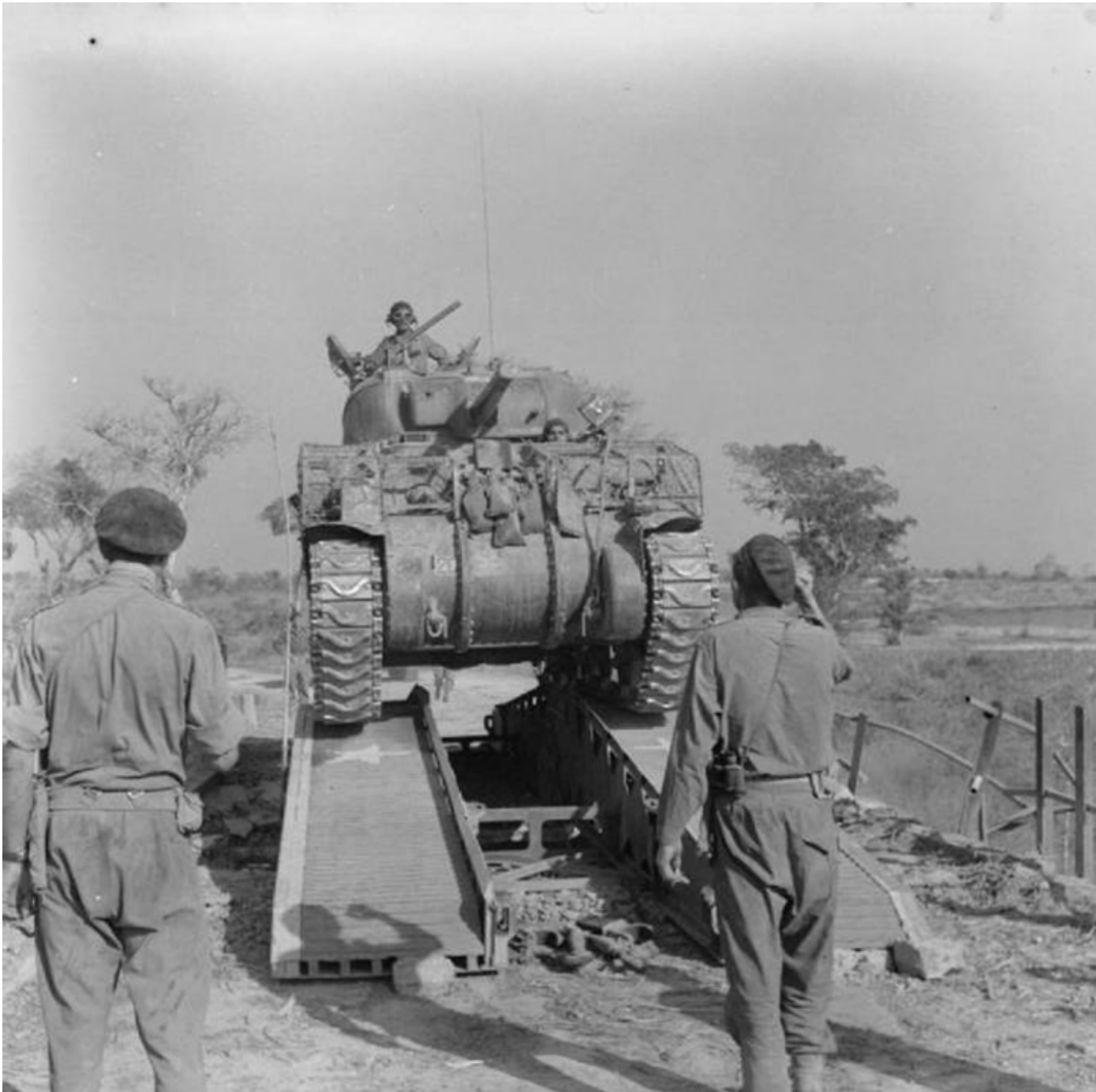
Above: A Sherman of 9th (Royal Deccan) Horse crosses a Valentine AVLB-laid bridge near Meiktila in 1945.

Note the mysterious marking showing '20' on white square. It is thought that this marking relates to the capacity of auxiliary water tanks fitted internally. Although it's very difficult to see, the bridging weight mark ('30' on a yellow disc) is painted between the '20' marking and the track. The Arm-of-Service sign ('53' on a red-over-yellow square) is also just visible – painted on the central panel of the transmission housing, just to the right of the '20' marking.