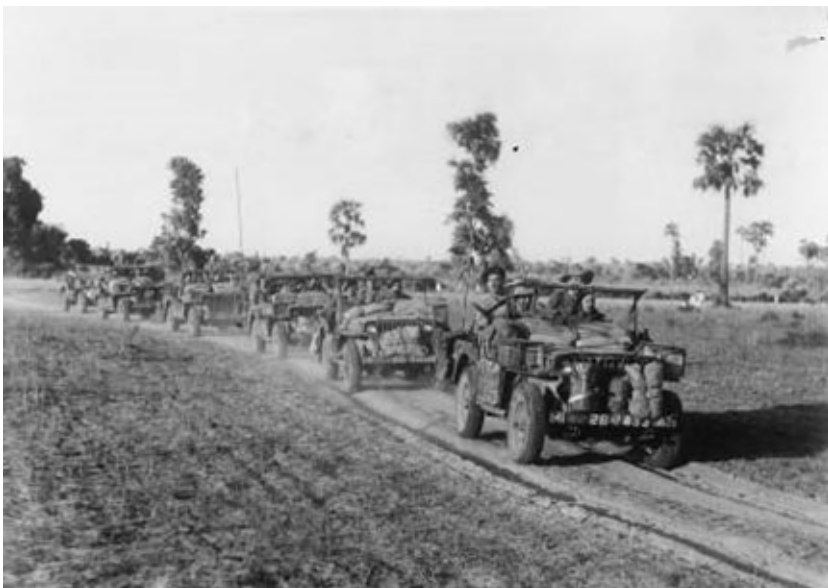
Left: A Jeep-mounted patrol of 2nd Recce Regiment in 1945.

Is this unique? The author has never seen any other examples of a Universal Carrier being used as a self-propelled mortar.